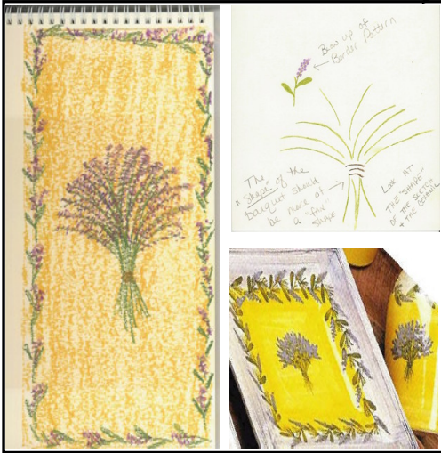
Sketches and pottery